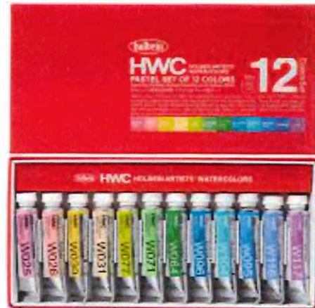
Holbein Artists Watercolors Pastels, set of 12 ml tubes