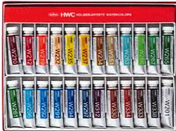
Holbein Artists Watercolors Set of 18 or 24, 5 ml tubes

If you are just starting your paint collection, you may wish to purchase a variety tube set. Here are two sets that have many basic colors. This will be plenty of colors, and usually there is plenty of sharing among the students too. (Amazon)